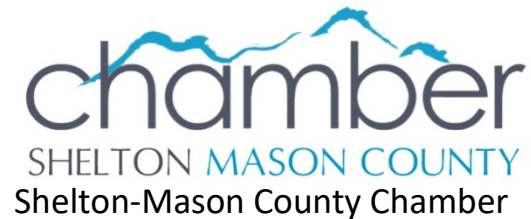
Shelton-Mason County Chamber